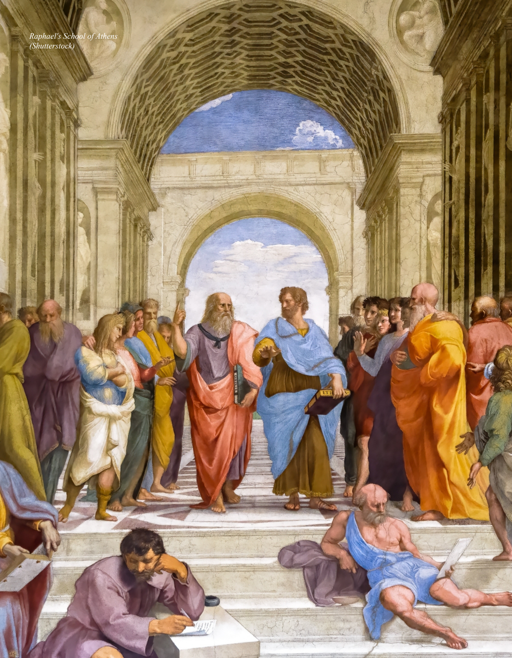
Raphael's School of Athens