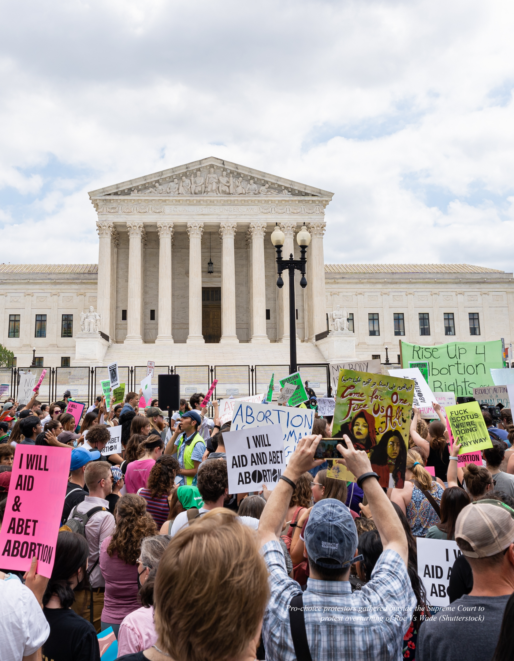
Pro-choice protestors gathered outside the Supreme Court to protest overturning of Roe v. Wade