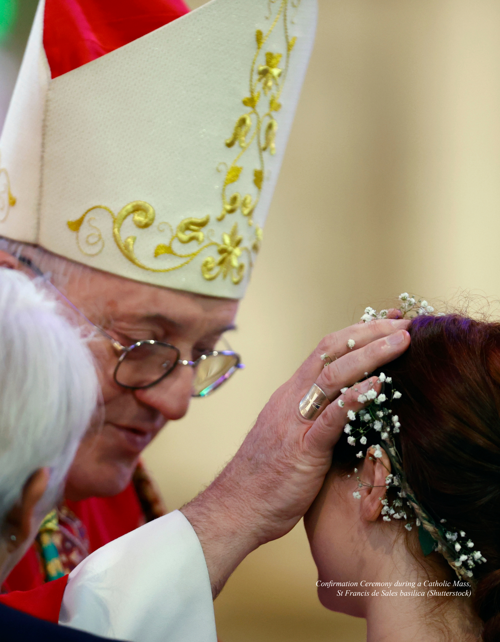
Confirmation Ceremony during a Catholic Mass, St Francis de Sales basilica