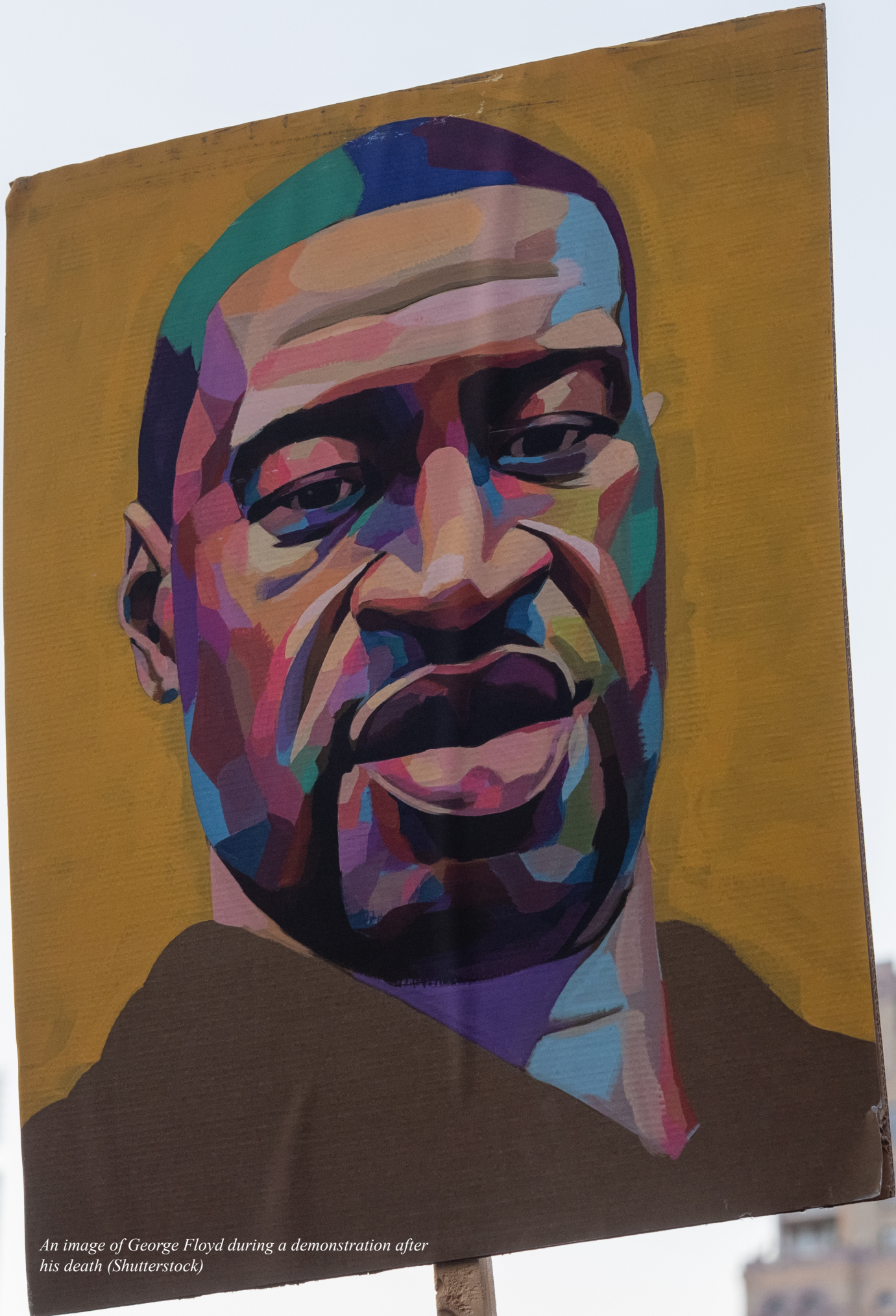
An image of George Floyd during a demonstration after his death