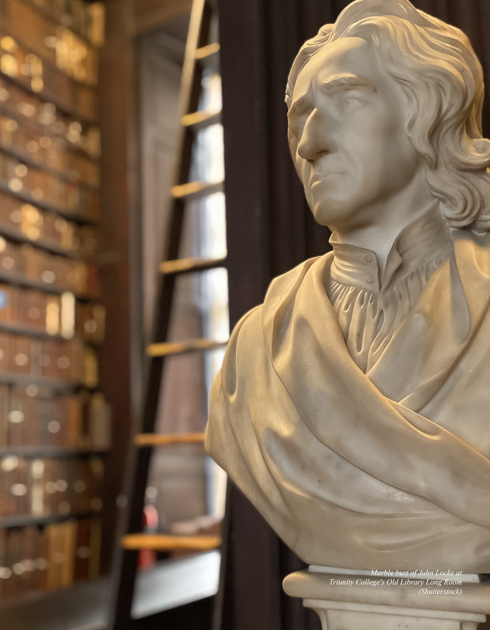
Marble bust of John Locke at Trinity College's Old Library Long Room