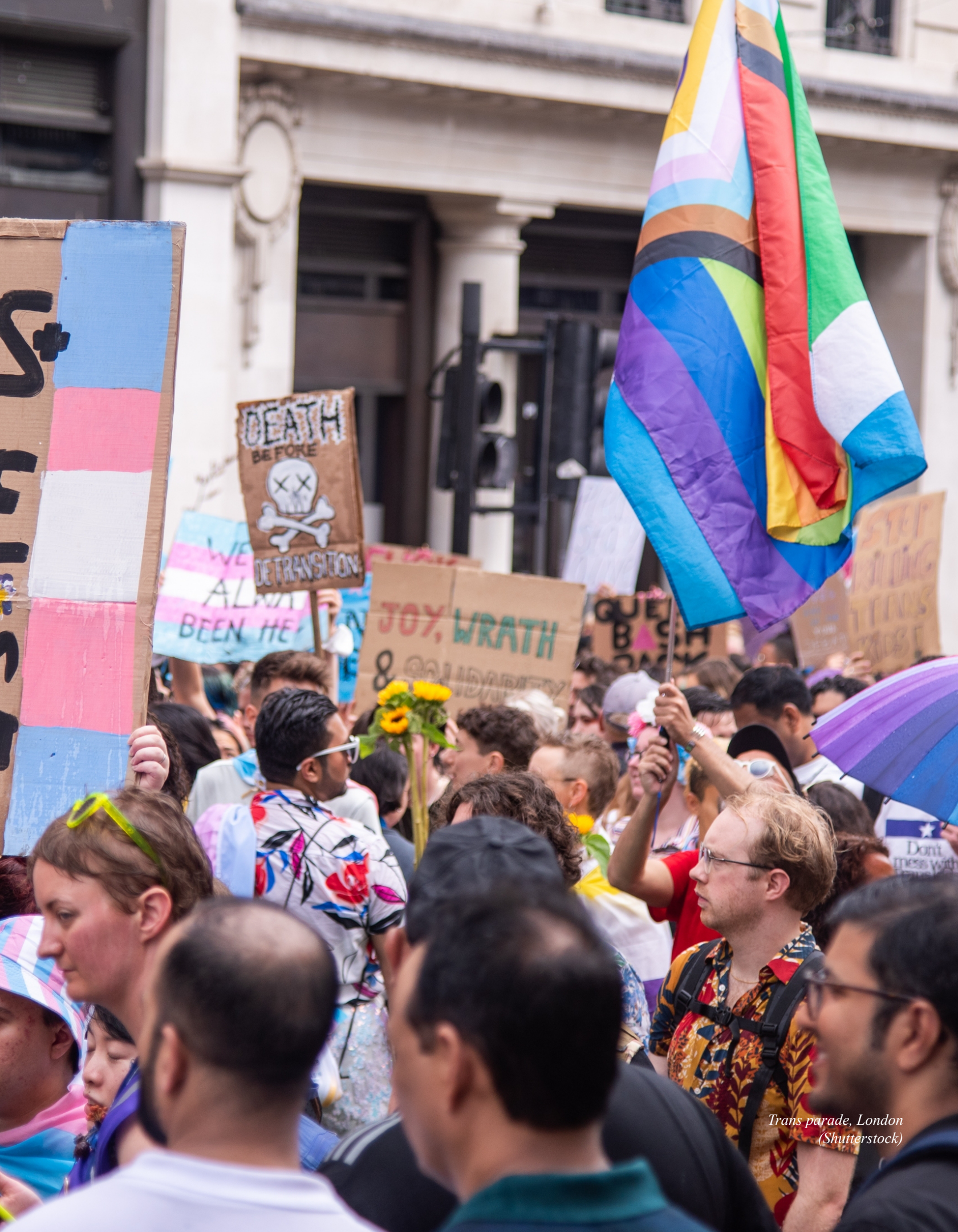
Trans parade, London