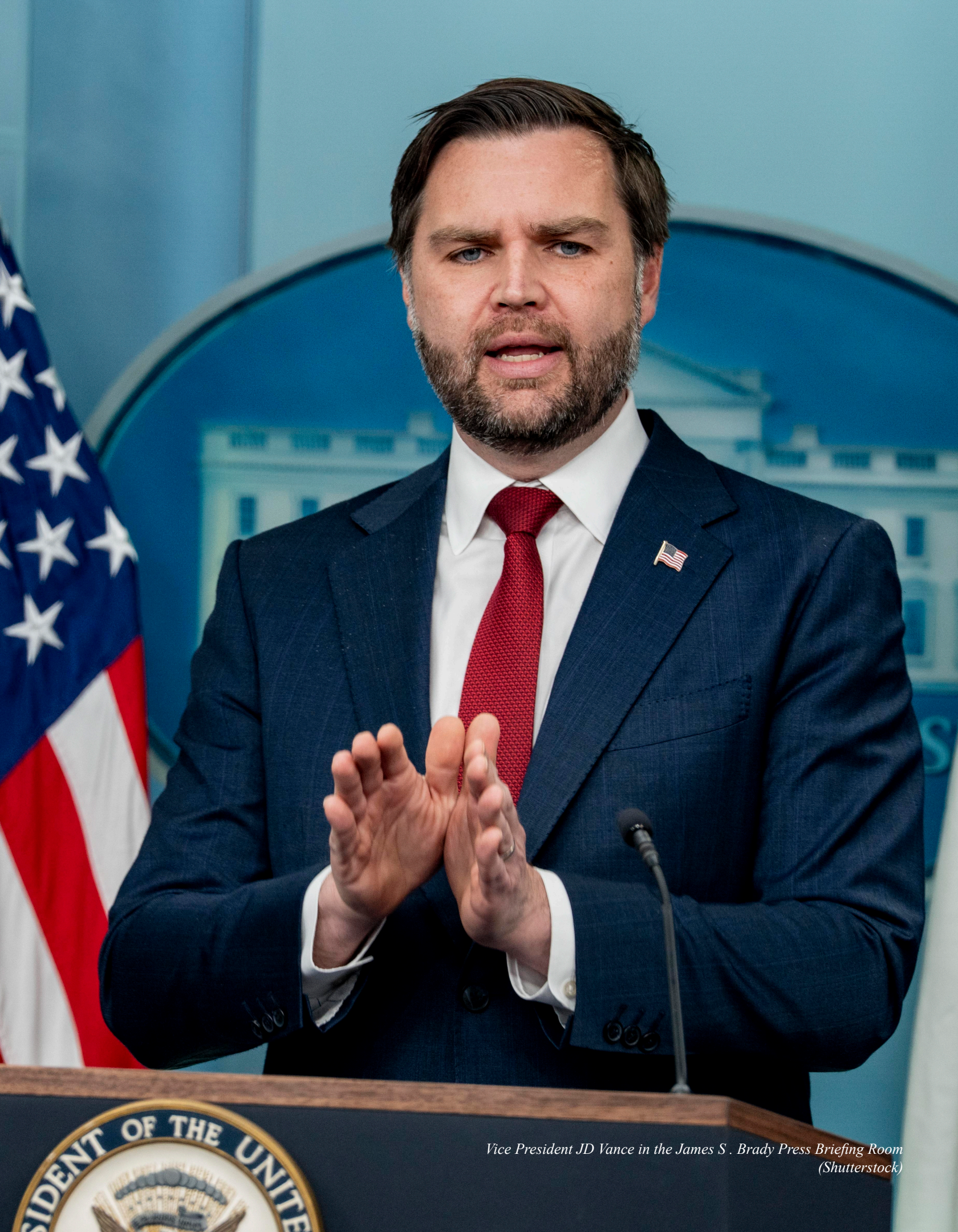
Vice President JD Vance in the James S. Brady Press Briefing Room