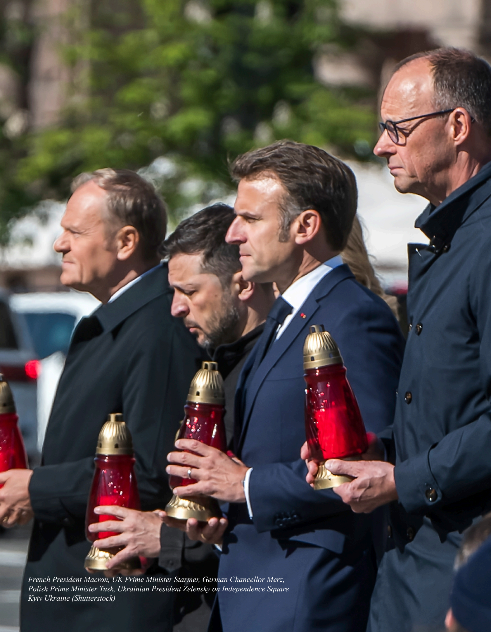
French President Macron, UK Prime Minister Starmer, German Chancellor Merz, Polish Prime Minister Tusk, Ukrainian President Zelensky on Independence Square Kyiv Ukraine