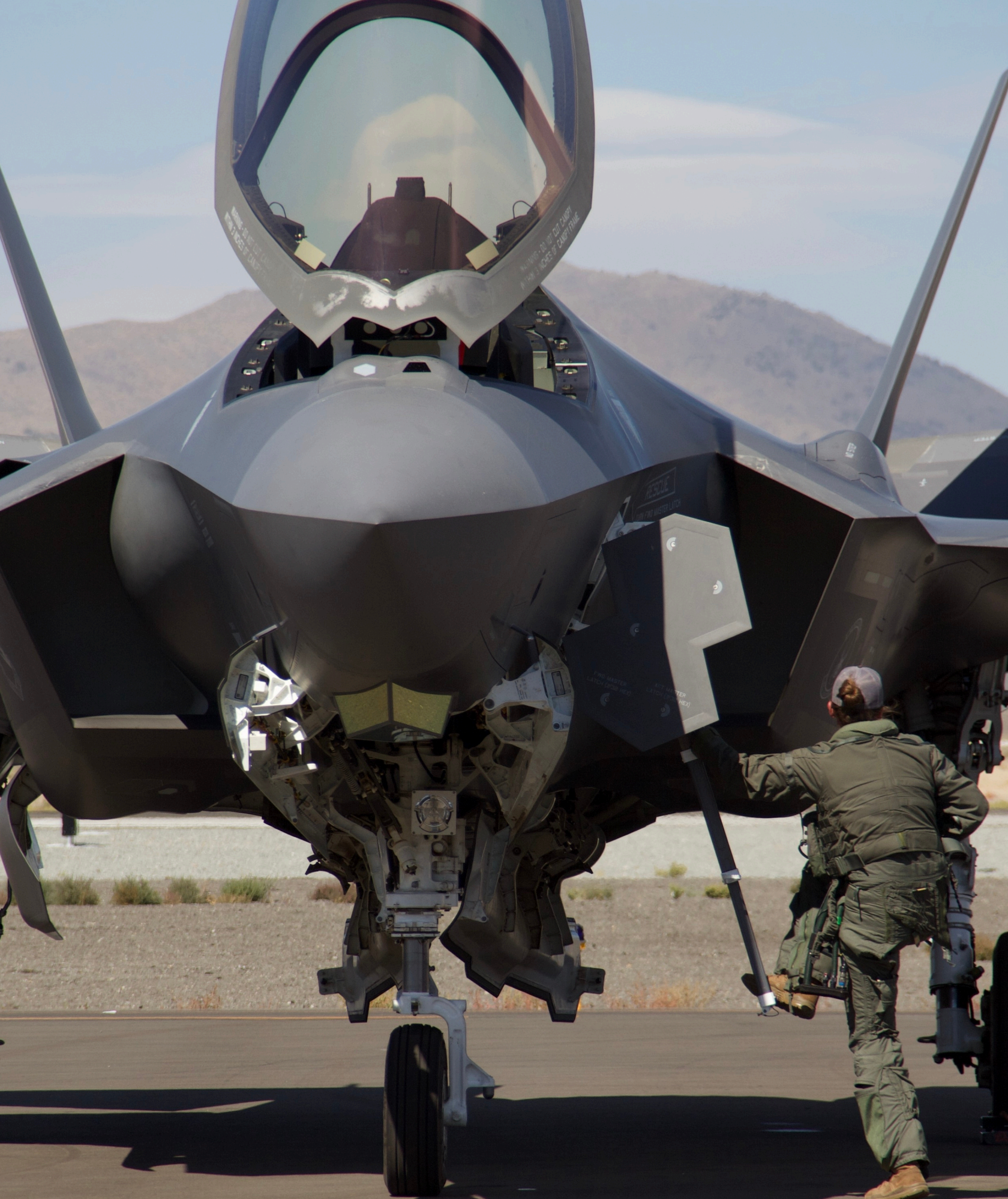
Lockheed F35 Lighting Demo Team