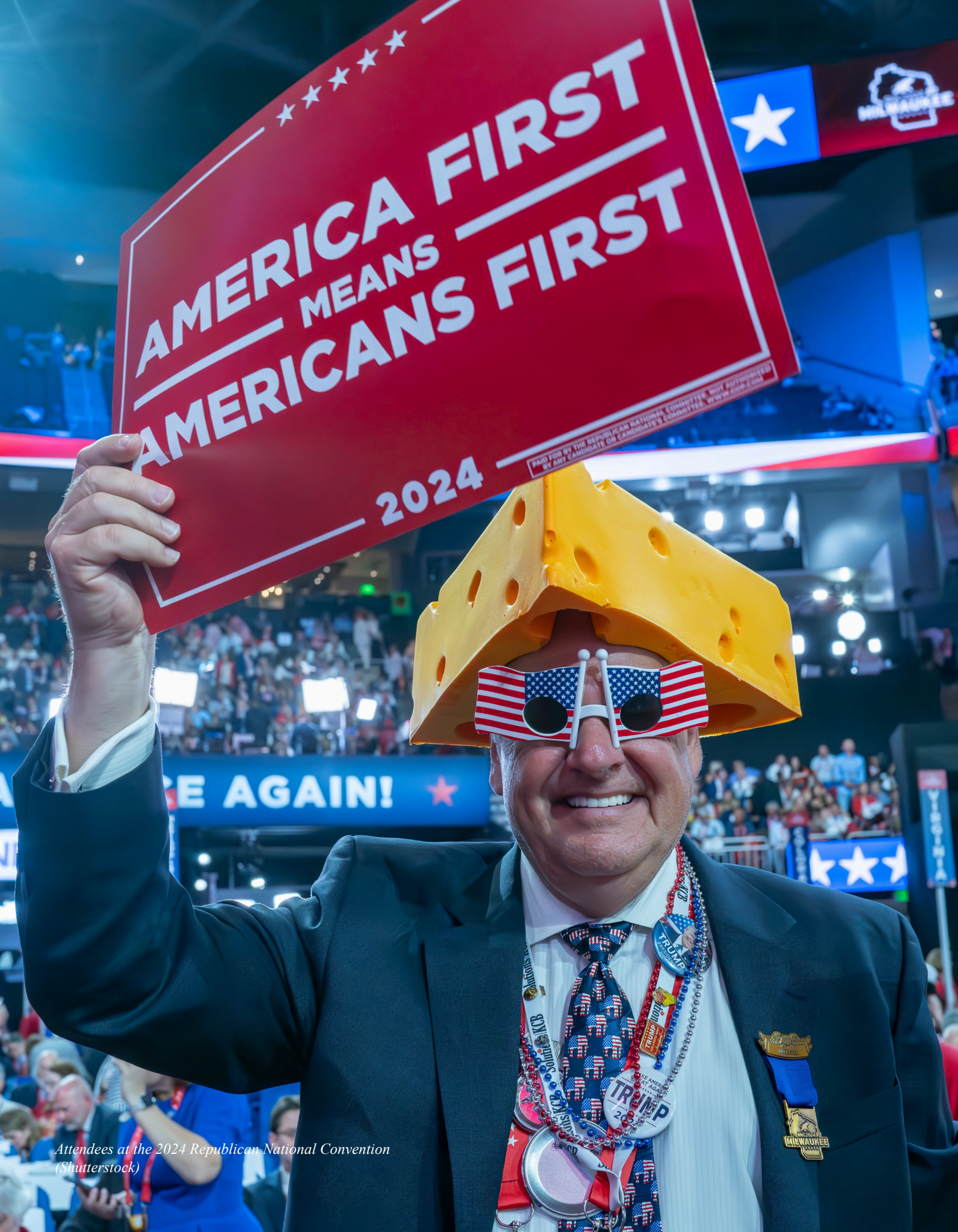
Attendees at the 2024 Republican National Convention