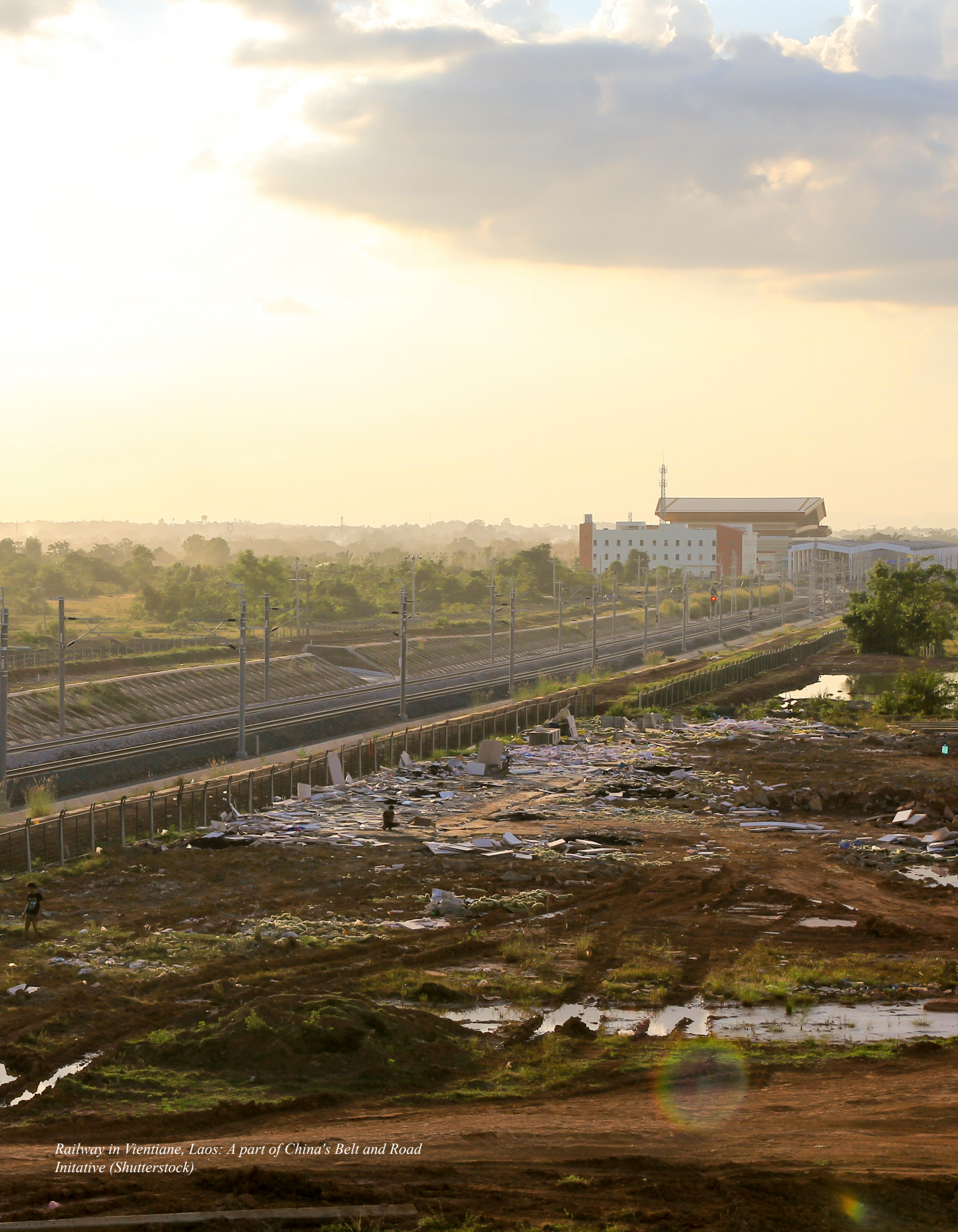
Railway in Vientiane, Laos: A part of China's Belt and Road Initiative