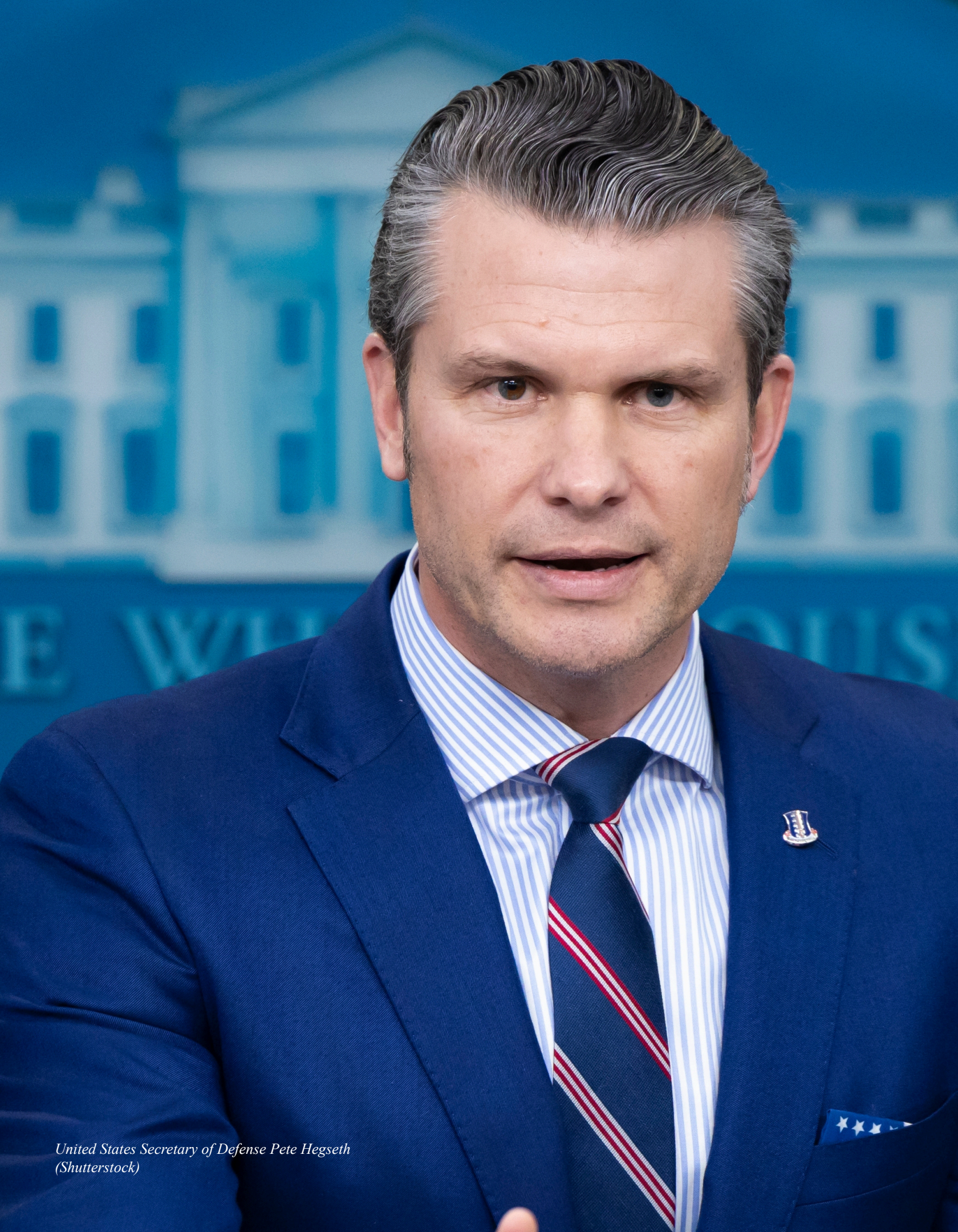
United States Secretary of Defense Pete Hegseth