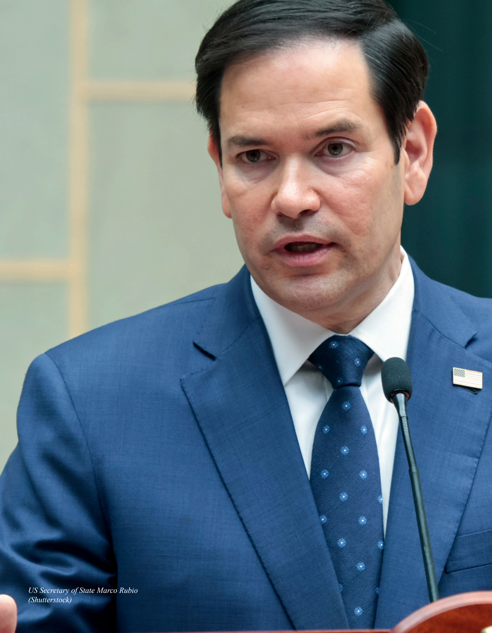
US Secretary of State Marco Rubio