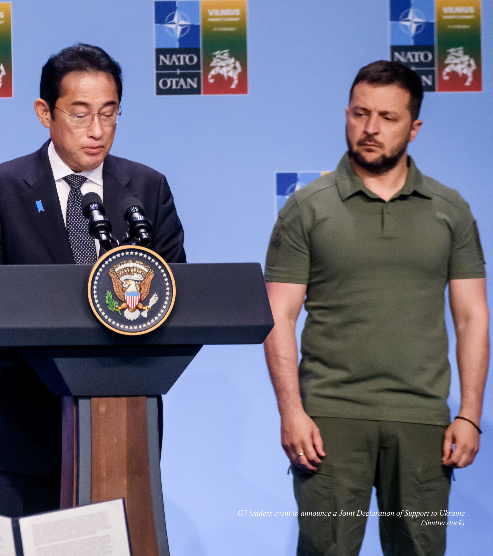
G7 leaders event to announce a Joint Declaration of Support to Ukraine