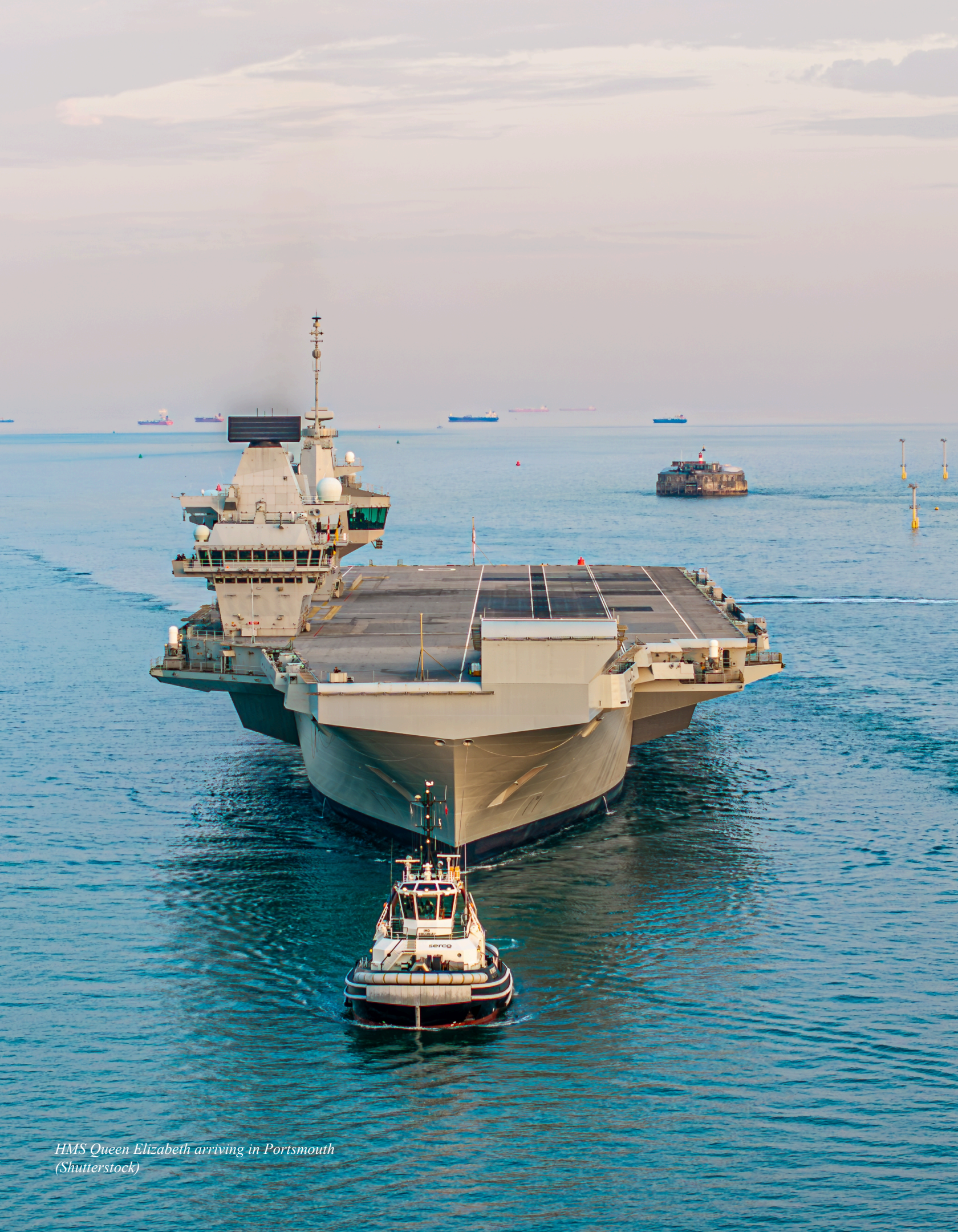
HMS Queen Elizabeth arriving in Portsmouth