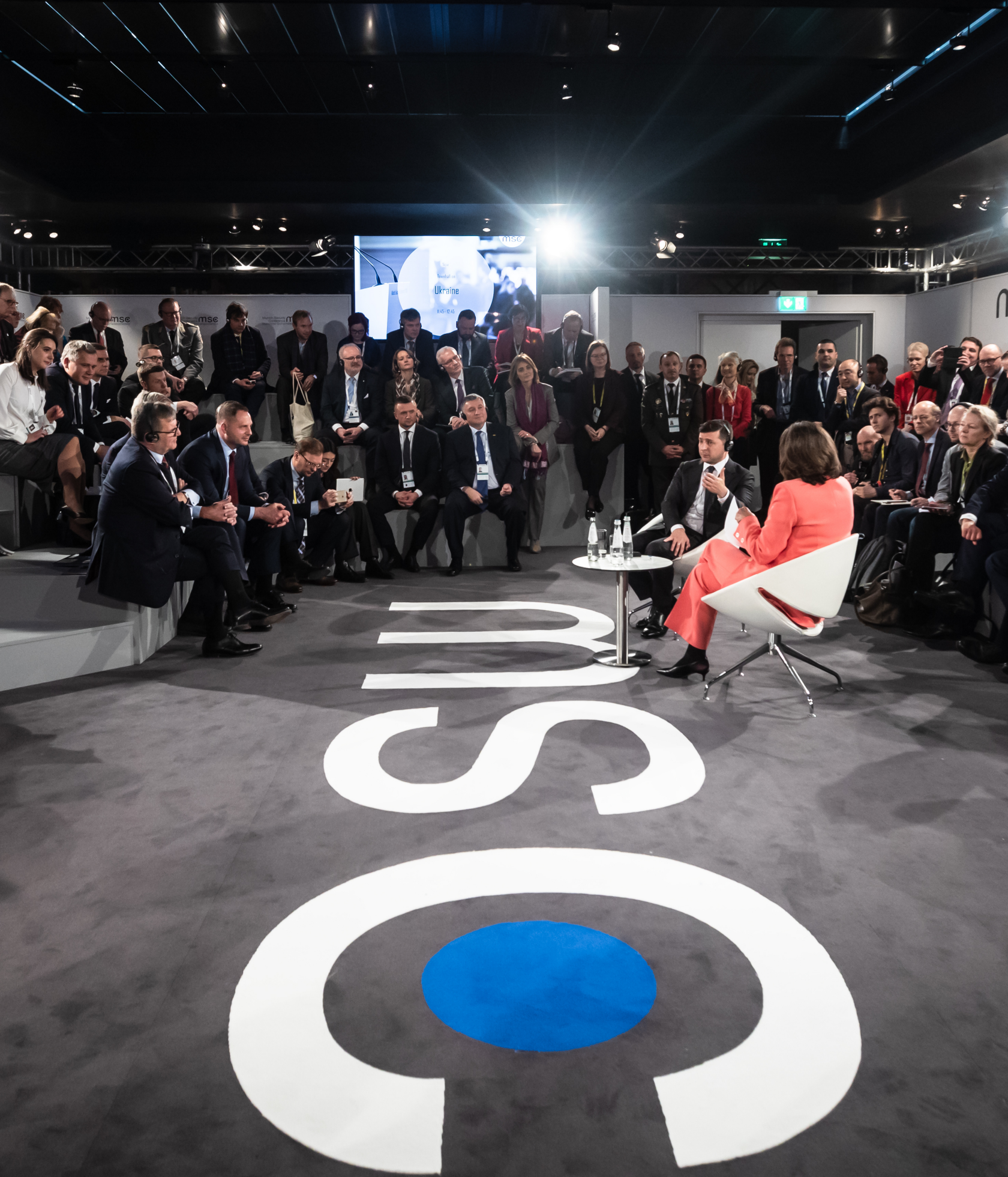
President of Ukraine Volodymyr Zelensky during the 2020 Munich Security Conference