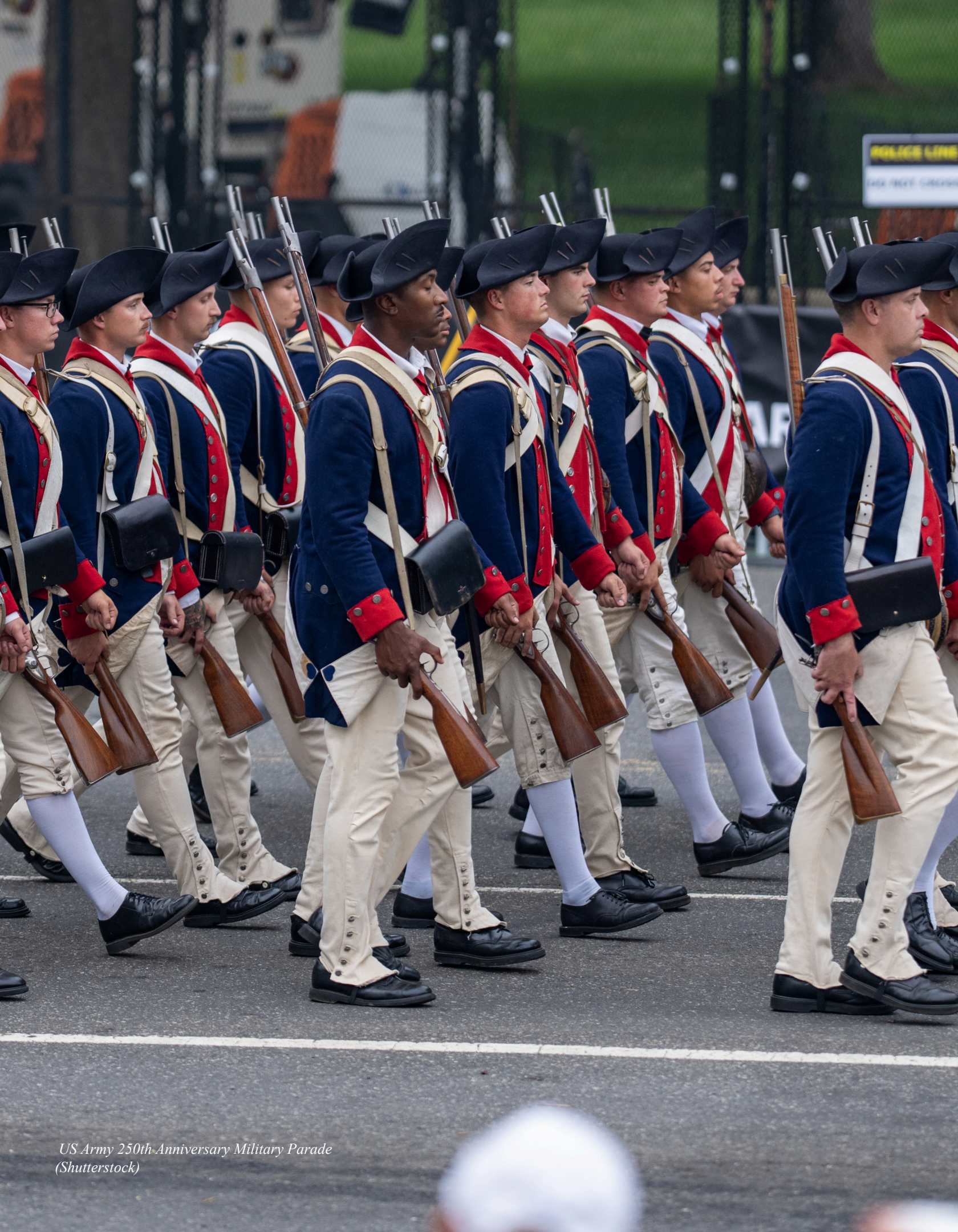
US Army 250th Anniversary Military Parade