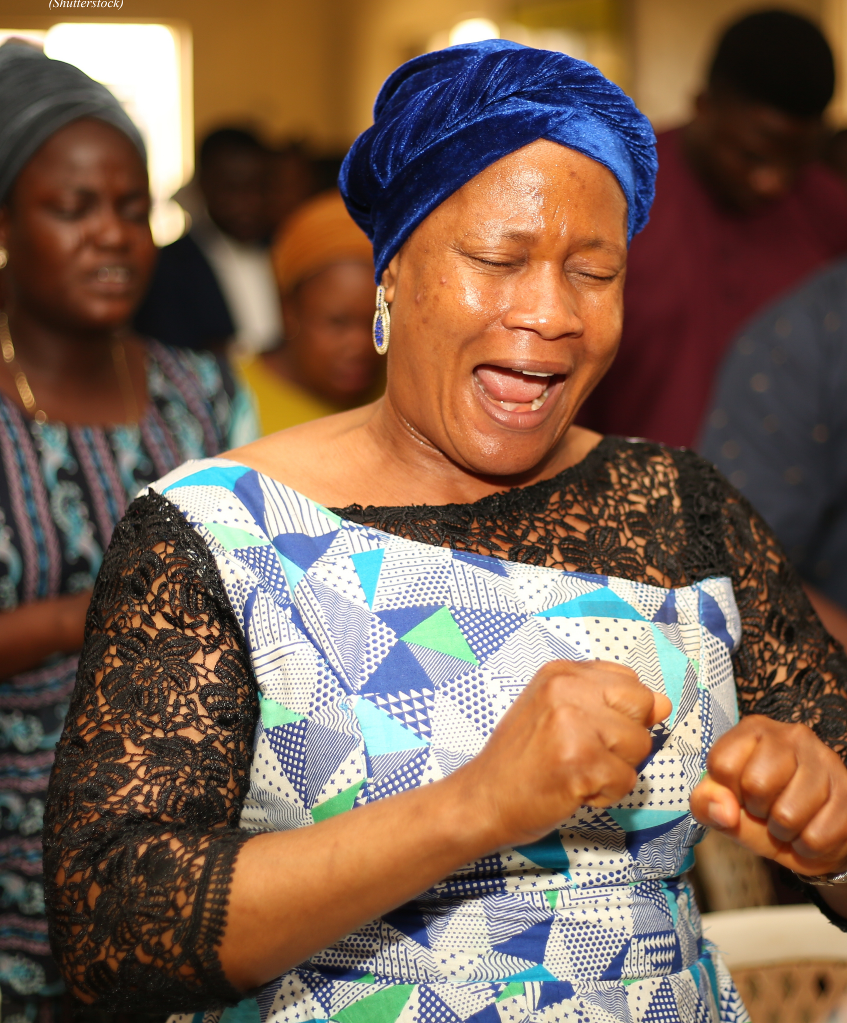
A woman in praying to God in a Church Lagos, Nigeria