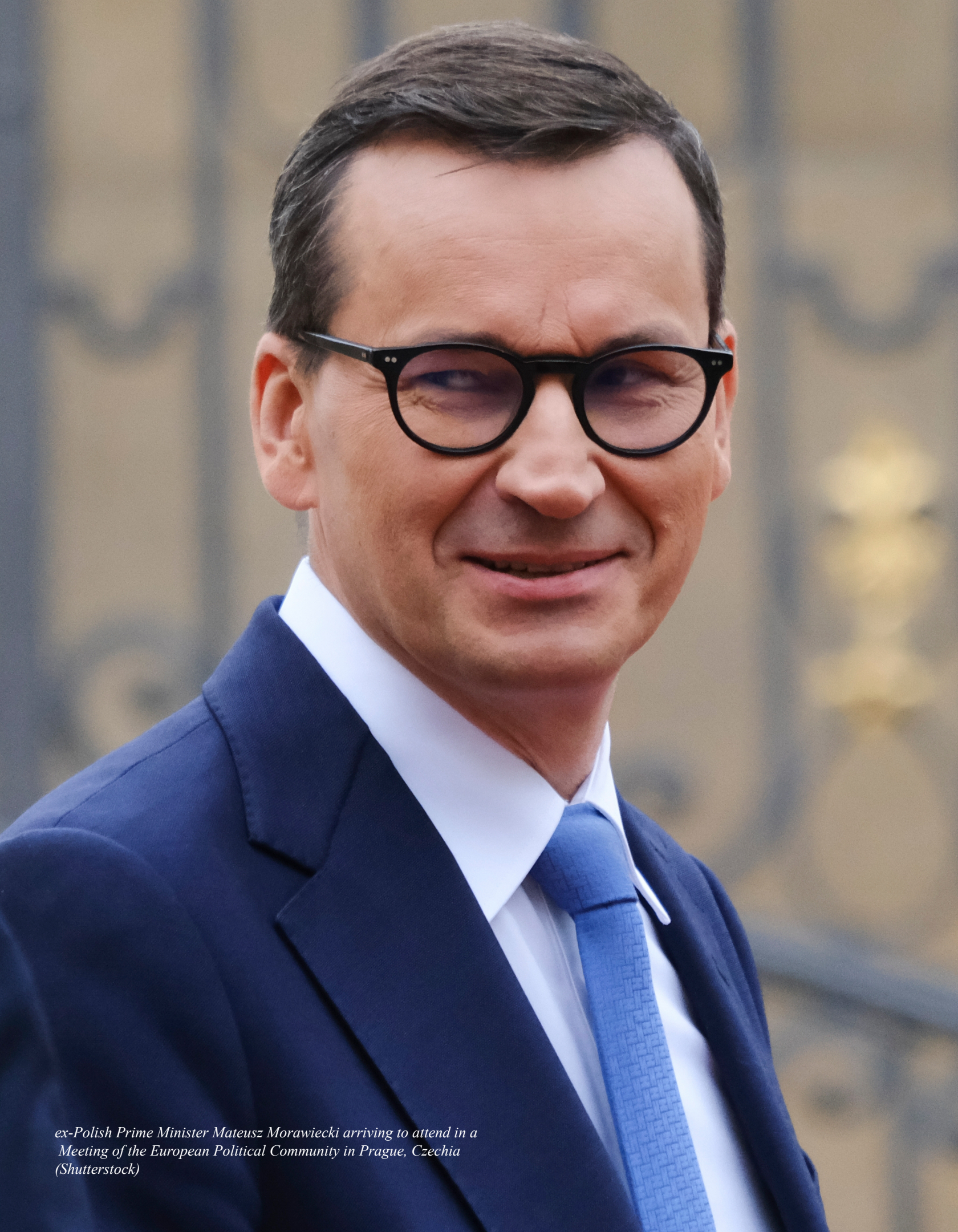
ex-Polish Prime Minister Mateusz Morawiecki arriving to attend in a Meeting of the European Political Community in Prague, Czechia