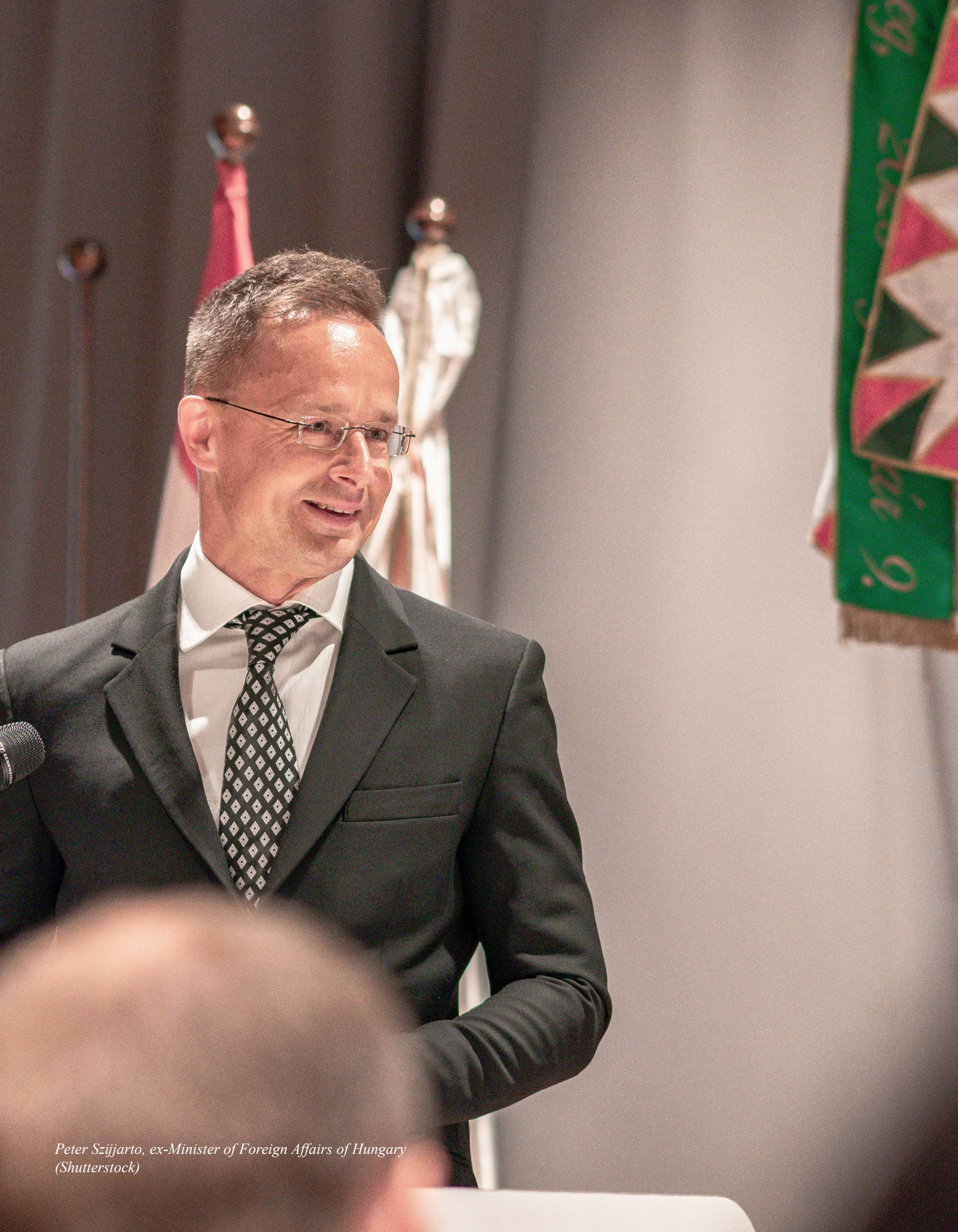
Peter Szijjarto, ex-Minister of Foreign Affairs of Hungary