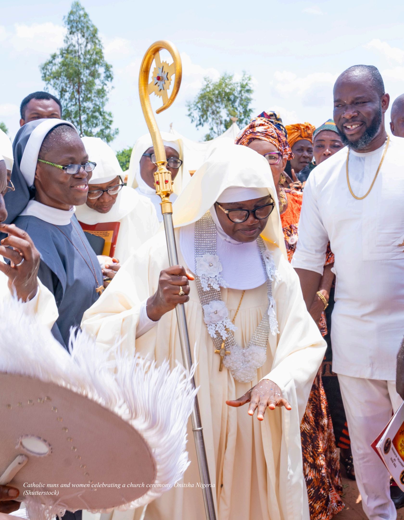
Catholic nuns and women celebrating a church ceremony, Onitsha Nigeria